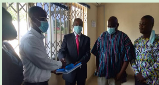
Figure 3. Submission of application for environmental release of GM cowpea to the National Biosafety Authority, Kwabenya, Accra