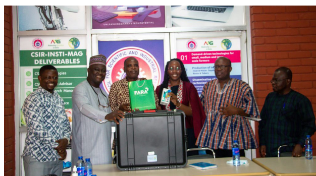
Staff of CSIR-INSTI, FARA team and representatives from MOFA