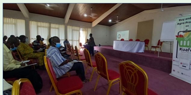
Stakeholders at the RELC meeting, Ho, Volta Region