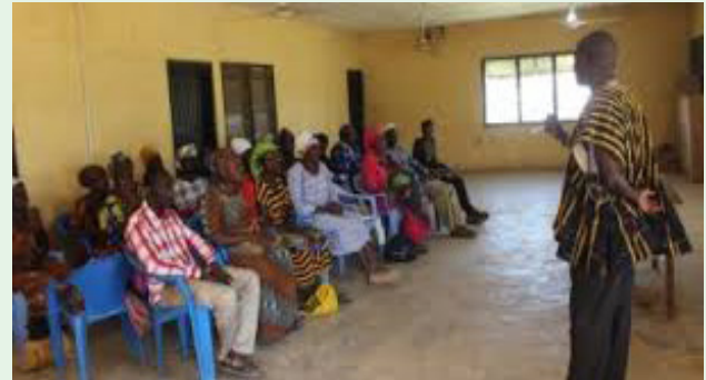
Savior Multi-Purpose Cooperative Members

Besides, there has been awareness creation for Research Extension-Farmer Linkage Committees (RELCs) and other stakeholder in 10 out of the 16 regions of Ghana. These regions are Greater