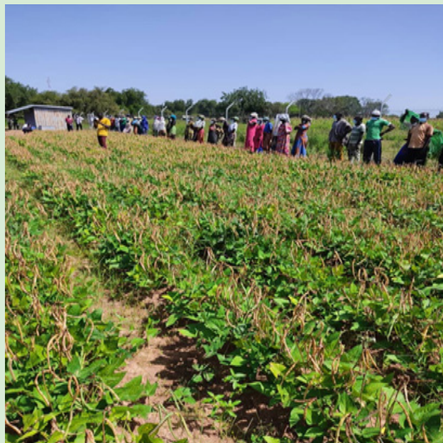
Figure 2. A visit to Pod Borer Resistant cowpea field at Manga, Upper East Region by cowpea farmers