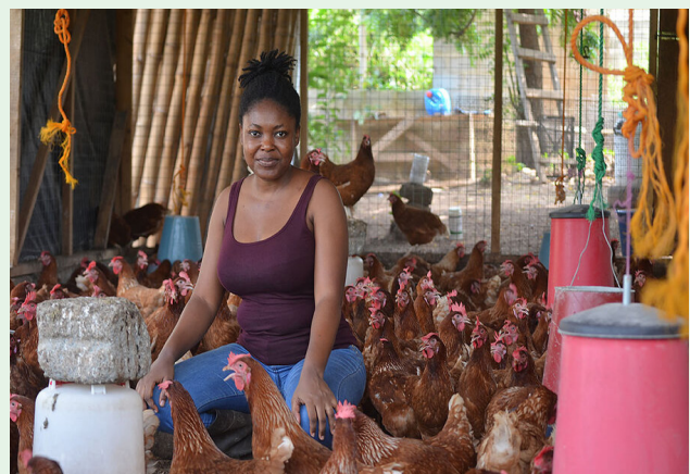
Women in Poultry Farming At Kwabre East