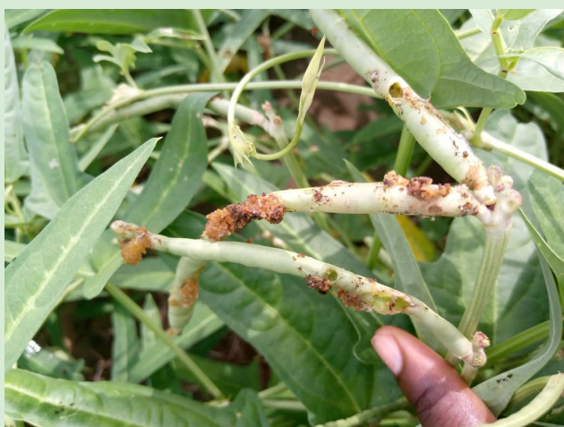
Figure 1. Legume pod borer damaged cowpea pods

To release this cowpea variety to farmers in Ghana, the CSIR-SARI submitted an application the National Biosafety Authority (NBA), Kwabenya-Accra, requesting for a permit for environmental release (Figure 3). The NBA is the state agency responsible for regulating safe application and use of genetically modified organisms (GMOs) in Ghana. CSIR-SARI's application is being processed and the institute is optimistic that a permit will be issued for multi-locational trials to be conducted as part of the steps for varietal release in Ghana.